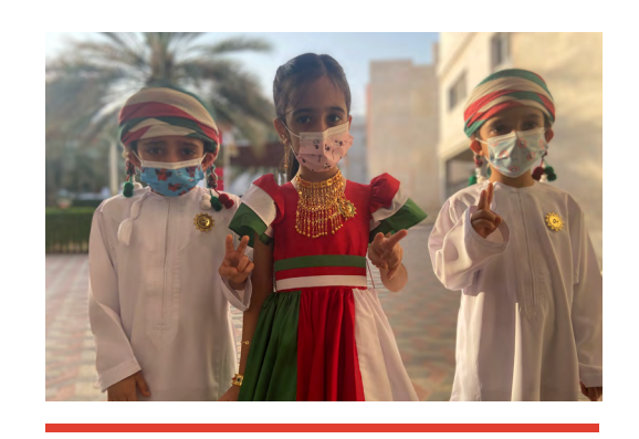
We, a nation of diversity and unmatched generosity, shall thus leave our extraordinary imprint on the world, forevermore.