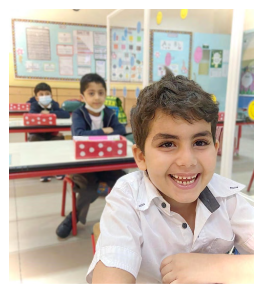
ISC-Muscat students are continuing their education without missing a beat.

Despite the current pandemic and subsequent disruption, and regardless of their physical location, ISC-Muscat students are continuing their education without missing a beat. Thanks to highly developed E-learning solutions, a structured and systematic approach, and incomparable learning habits, SABIS® students have adapted rapidly to a changing world, and the learning has never stopped!